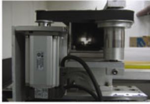
AC servo motor